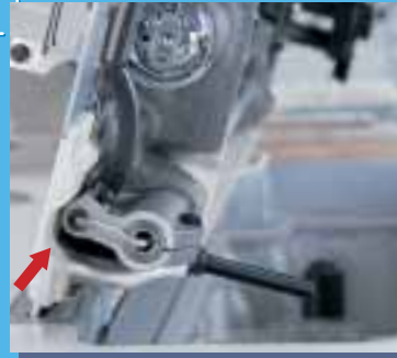
Feed eccentric pin

In addition, the machine is provided with a mounting seat for attachment to improve workability while replacing the attachment and increasing the durability of the machine bed surface.